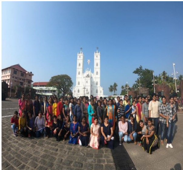
SHRINE BASILICA CHURCH, OF MOTHER MARY, VALLARPADAM, ERNAKULAM

The group were totally fascinated by the beautiful locales of Kerala- God's own country as they had been treated to beautiful sights and natural settings. They submitted a record of their impressions in the form of short films, written reports and scrap books to the English Department.