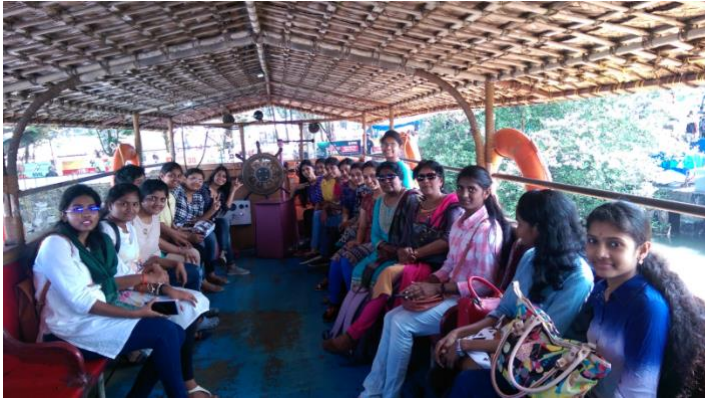
On the house boat